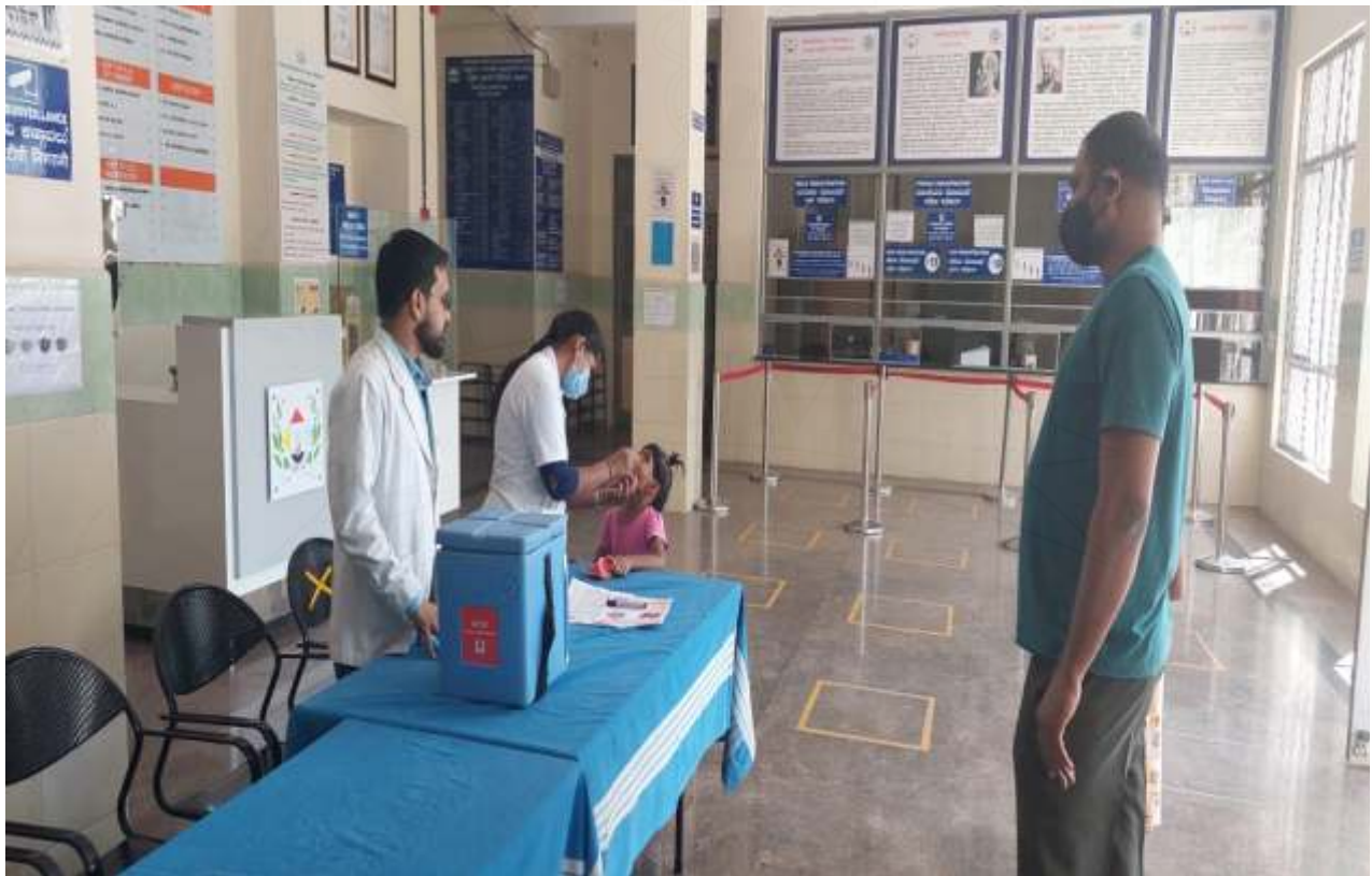
Pulse Polio Drive