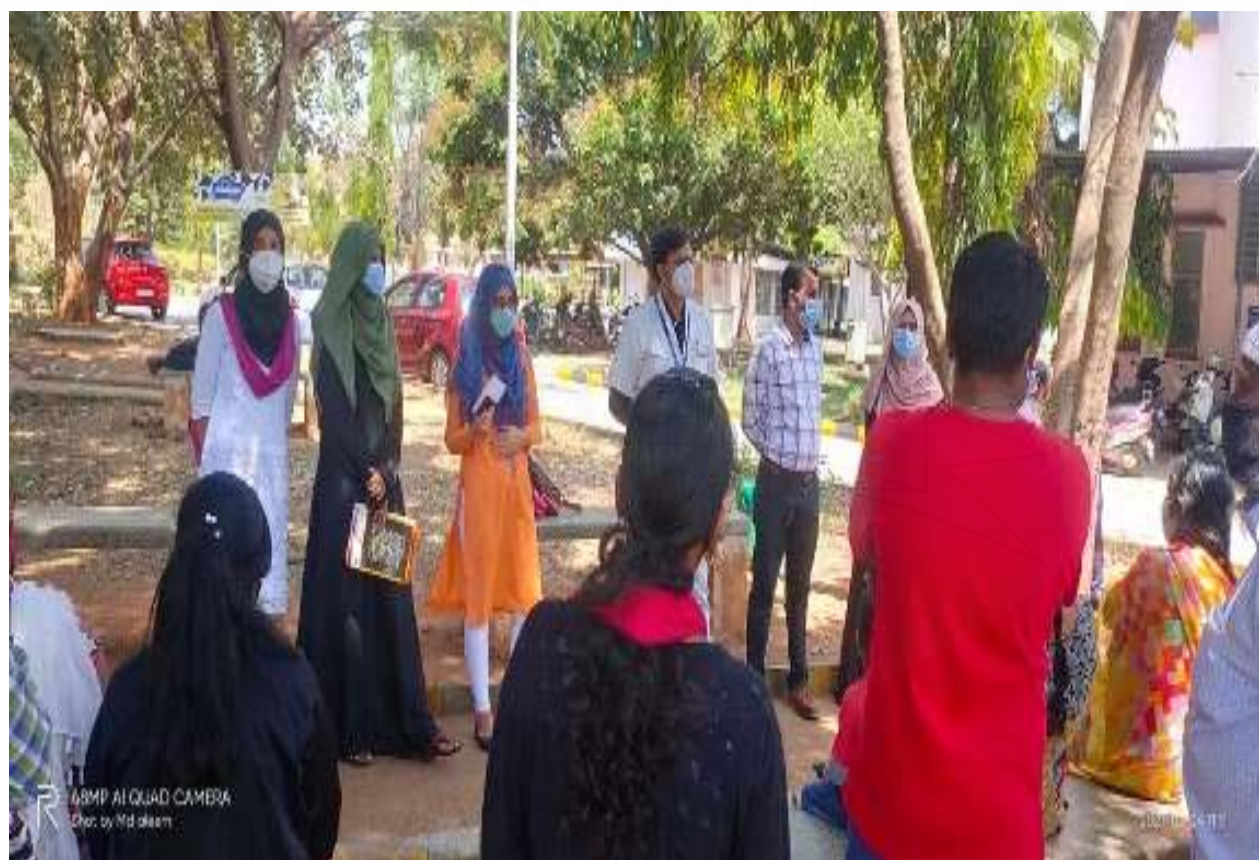
Health Awareness Programmes on Various Health Days