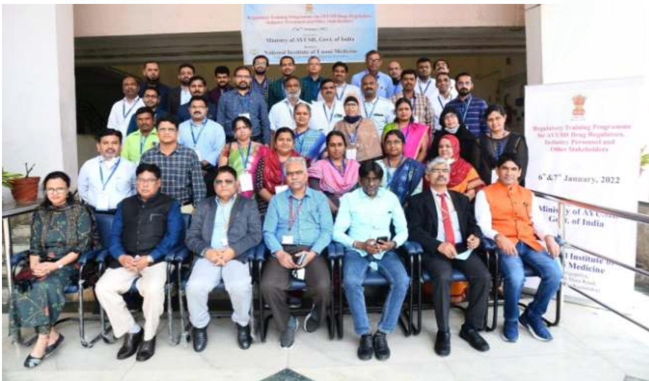
Regulatory Training Program for Ayush Drug Regulators, Industry Personnel and other Stakeholders