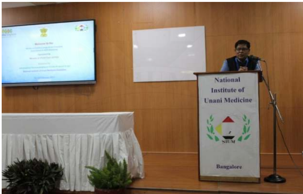
Hands-on training on Causality Assessment and ADR Reporting