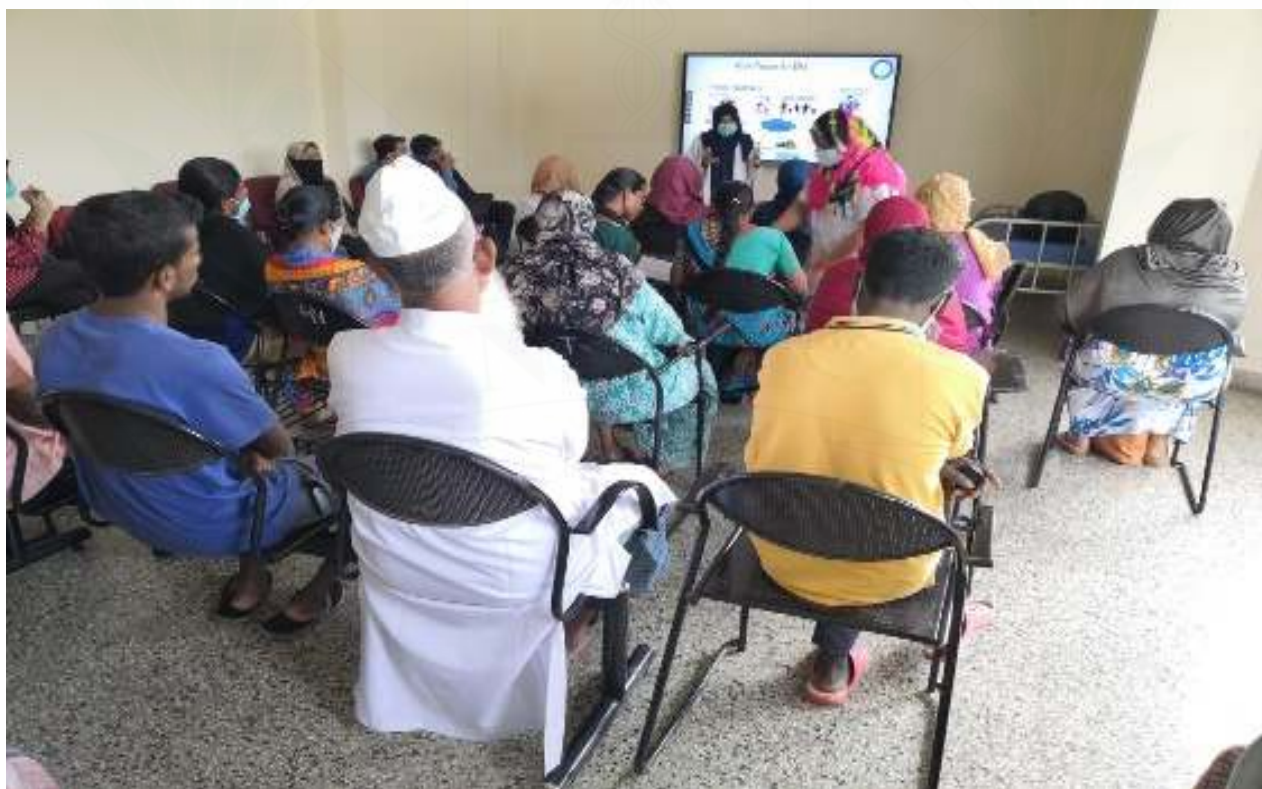
Health Awareness Programmes on Various Health Days