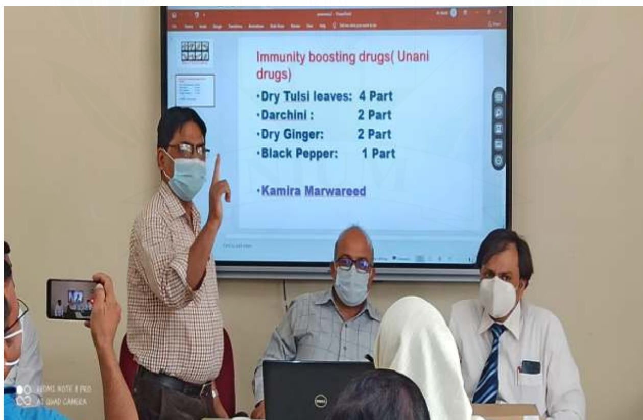
World Health Day