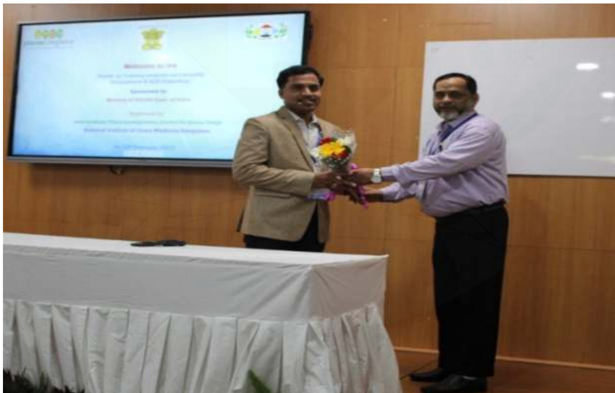
Hands-on training on Causality Assessment and ADR Reporting