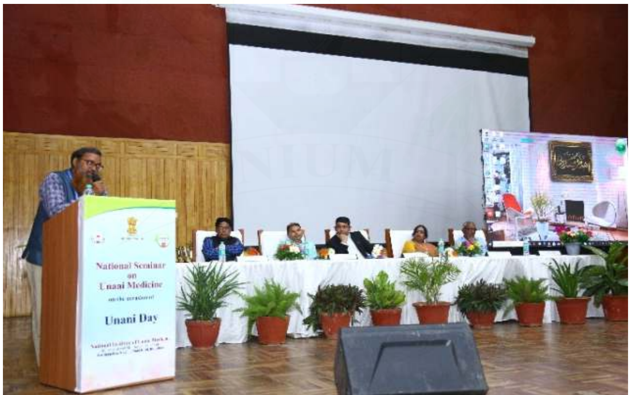
Unani Day Celebration