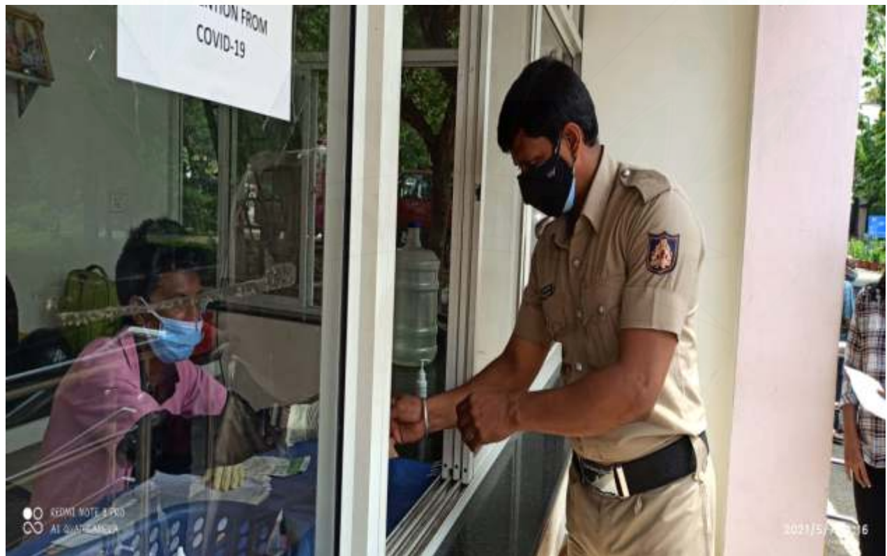
Prophylactic Unani Drugs Distribution