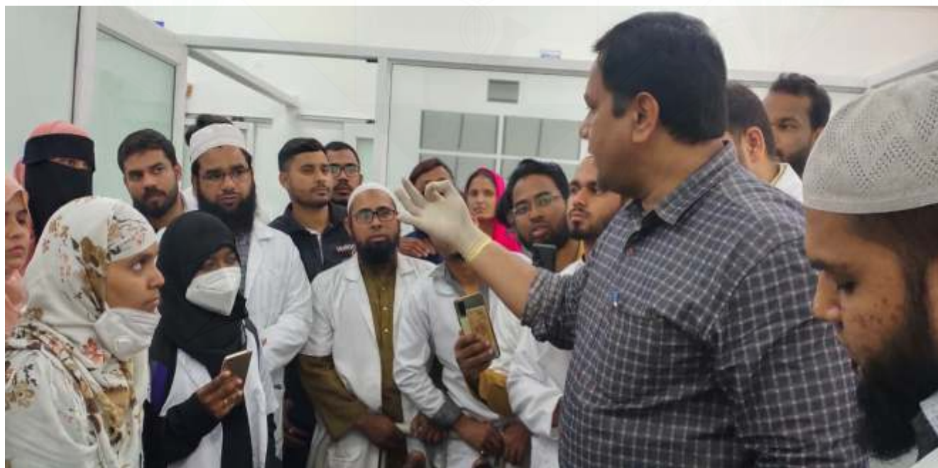
Inauguration of Cupping Therapy Assistant Course