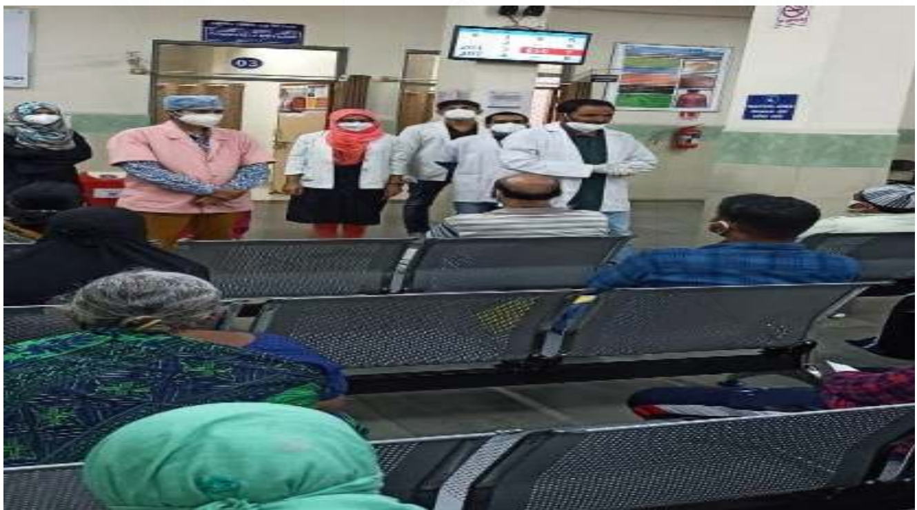
Health Awareness Programmes on Various Health Days