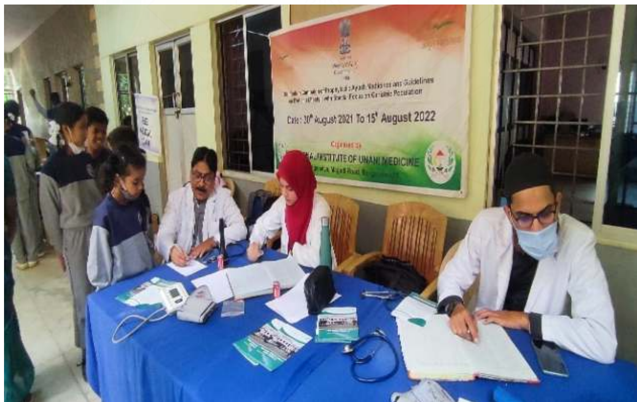
Prophylactic Unani Drugs Distribution