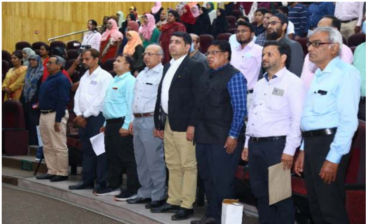
Unani Day Celebration