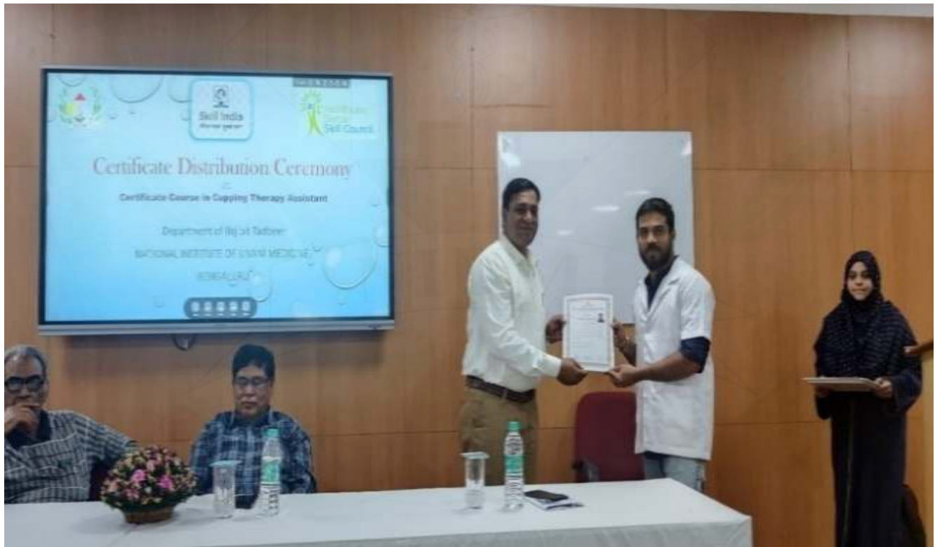
Certificate Distribution of Cupping Therapy Assistant Course