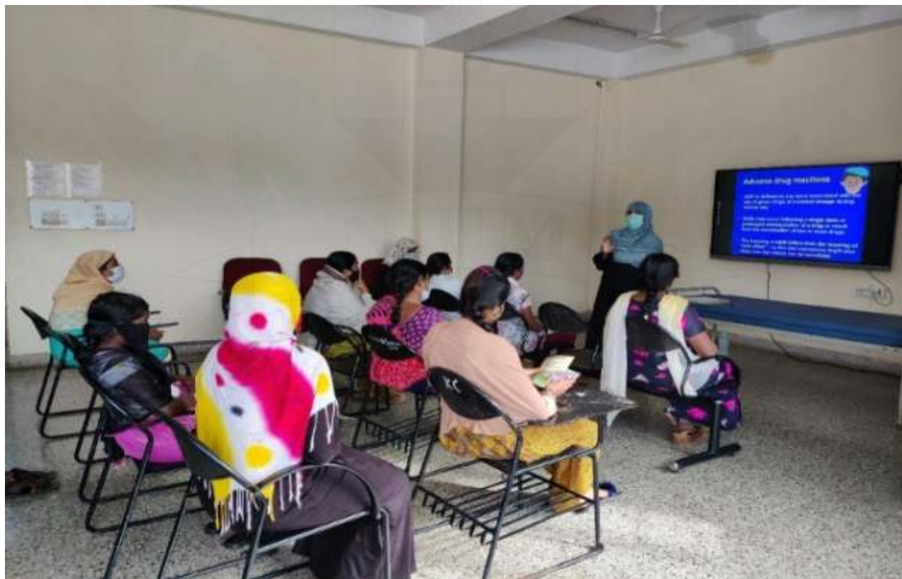
Awareness Programmes by IPVC, NIUM