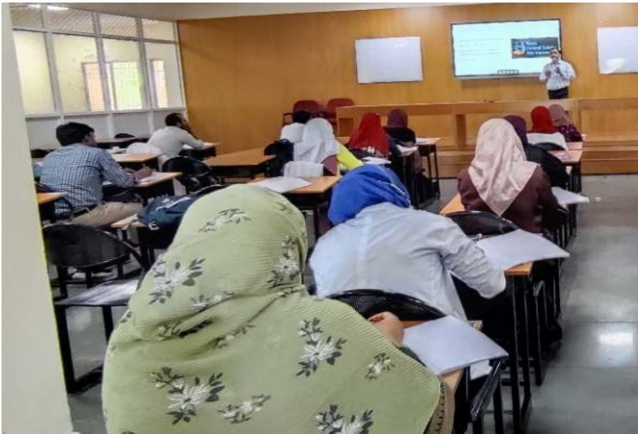
Awareness Programmes by IPVC, NIUM