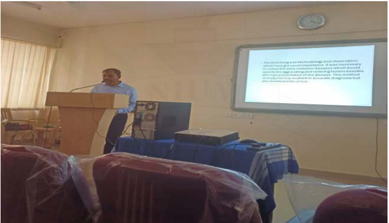
Guest Lectures Delivered by NIUM Faculty Members in Various Colleges